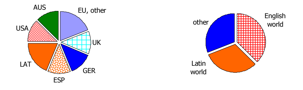
Figure 4. Geographical origin and language families.

As can be seen from the first bar chart on concepts covered , there is limited research on expected values and the normal distribution. These two ideas are certainly quite sophisticated but both are important for many professionals in their future careers, especially those who are not mathematicians or statisticians. The notion of the so-called bell curve is often mentioned in the literature, but it would be valuable to know the extent to which it is understood, as well as the underlying conditions and assumptions to ensure its validity in an application. The notion of expected value and expectation is less common but is also not well researched.